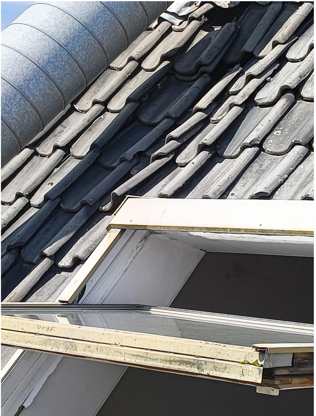
Tile slumping upper part