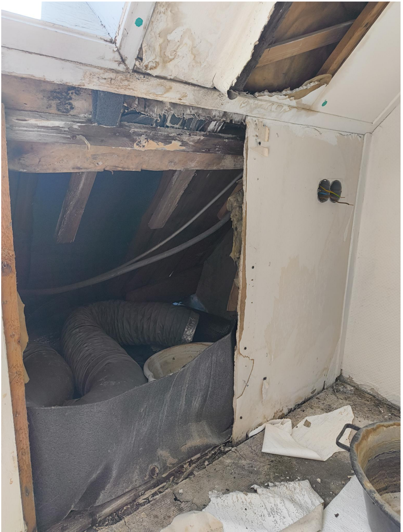
Light entering from roof