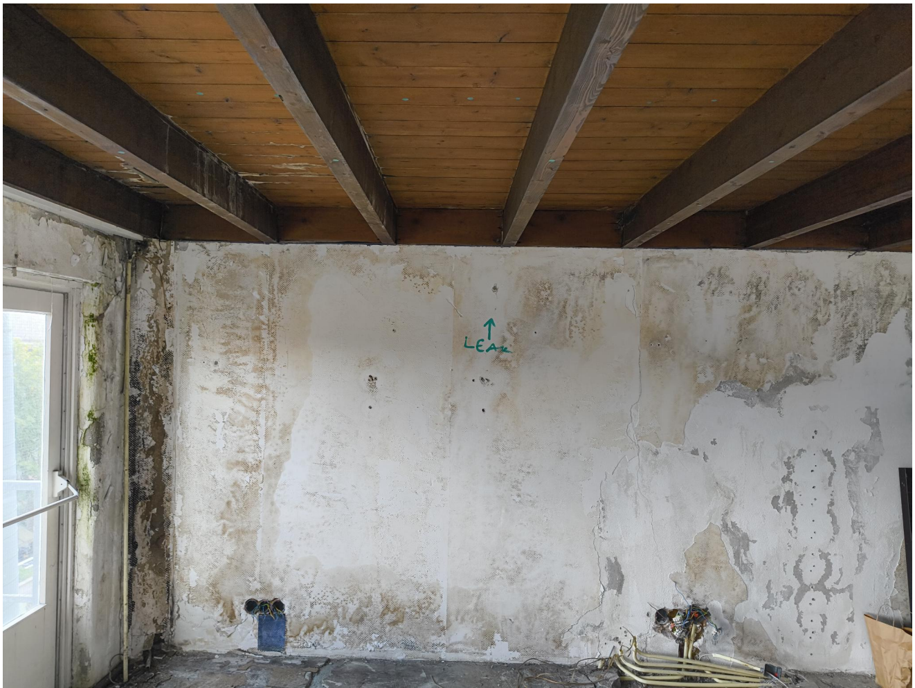
water damage floor 2