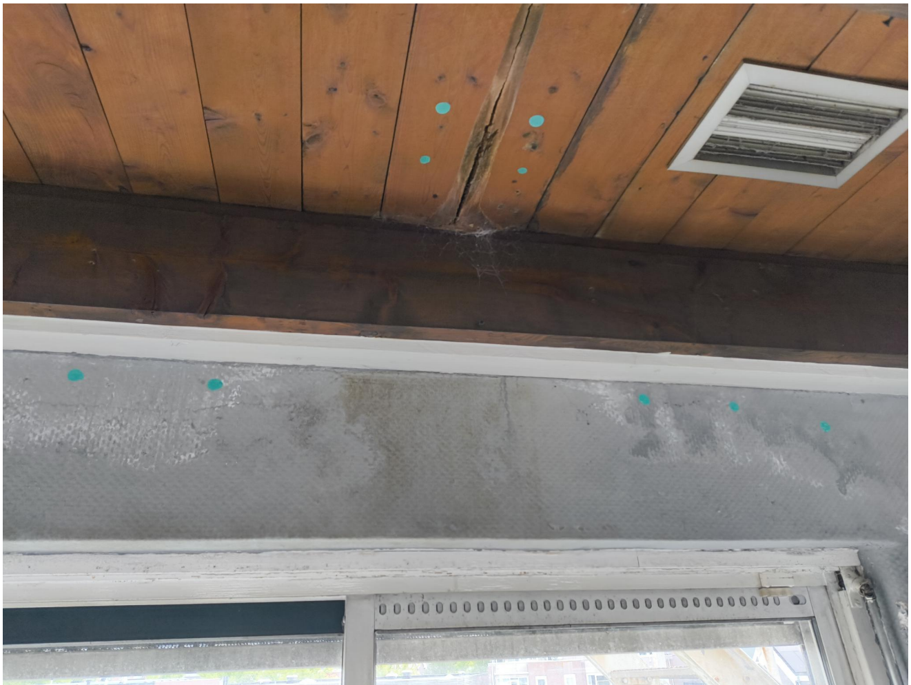
window damage floor 2