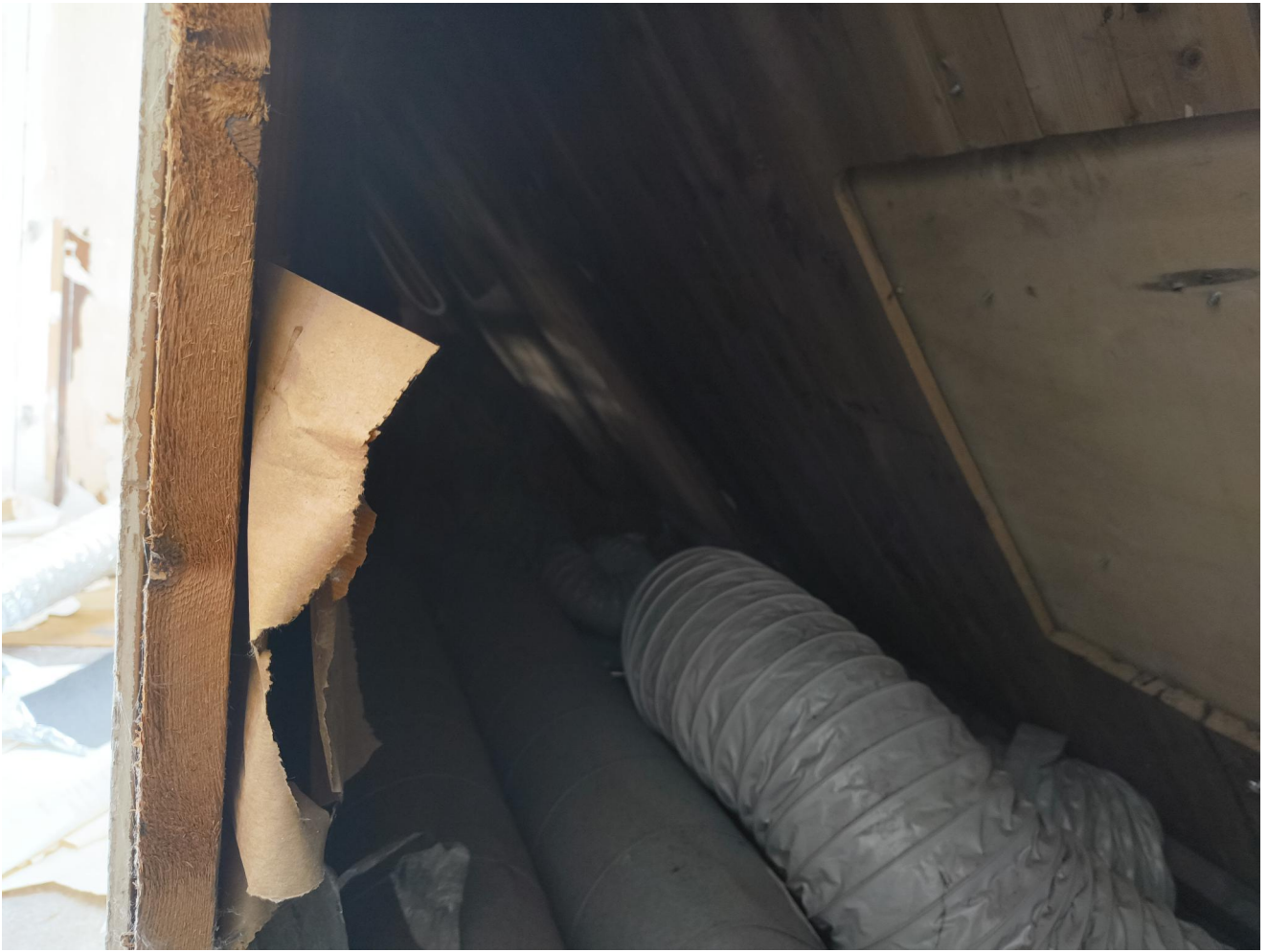
Light entering inside