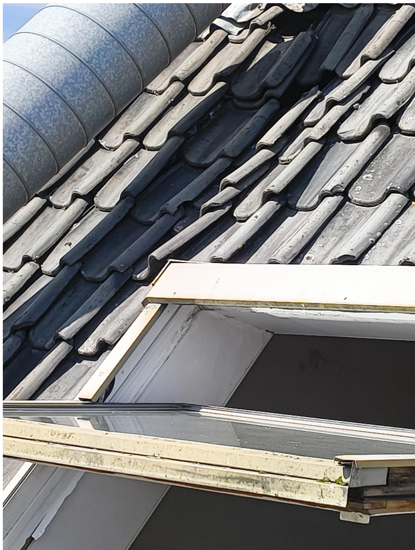
Tile slumping upper part