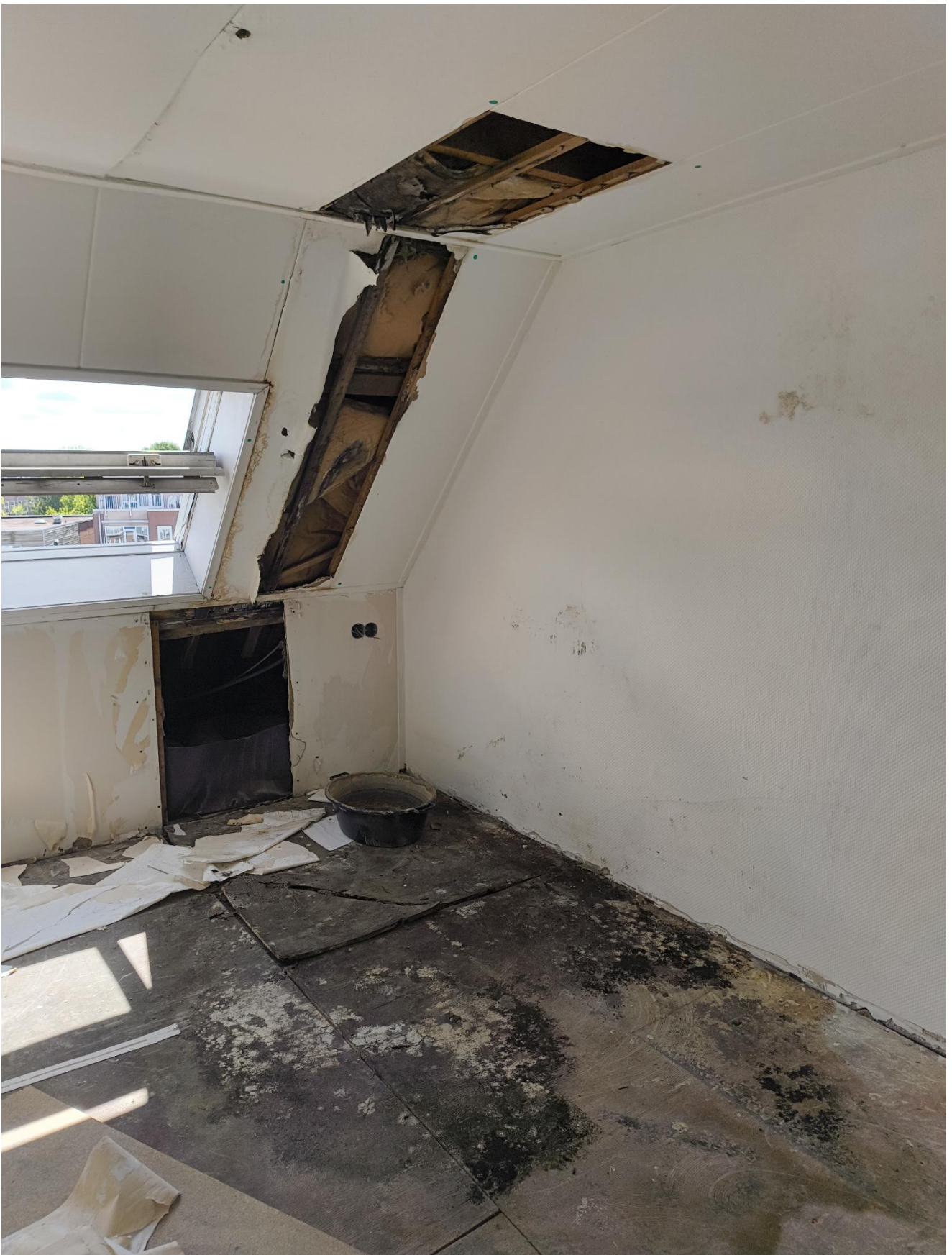
Ceiling wall and floor damage